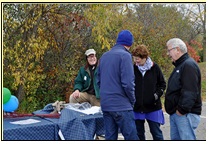
The Center of Things - Downtown Williams Bay