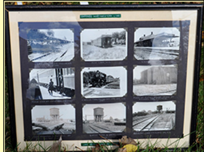
Kishwauketoe Nature Conservancy