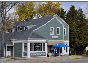
Then and Now Bayview Building 2014 (Old Hotton Building)