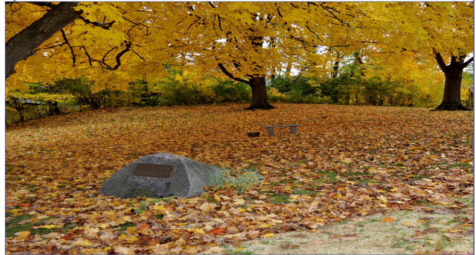
Ancient Native Burial Ground on Elm Street

The first Wonders of Williams Bay Historical Tour was held on Saturday, October 18 th . Eighty people registered for the event that was sponsored by the Williams Bay Historical Society.