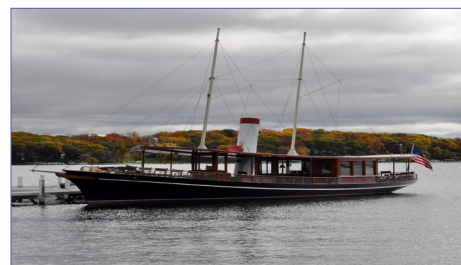
The Matriark - built in 1899

The self-guided tour began at Edgewater Park and highlighted 12 locations of historical value in or near the village. Volunteer docents at each location described its historical significance to both the village and the Geneva Lake area.