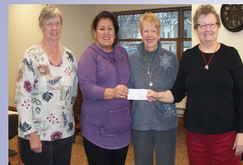
Williams Bay Lionesses present a $1500 donation to the Historical Society.