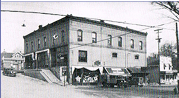
Granzow & Peterson Grocery Store - 1920s

Reprinted from Bay Leaves, Vol 7 No. 15, April 13, 1939