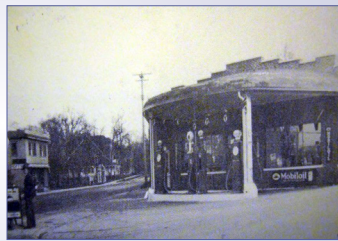
Hopkins and Walker Garage