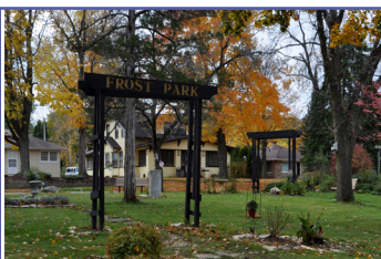
Frost Park Memorial to Dr. Edwin Frost