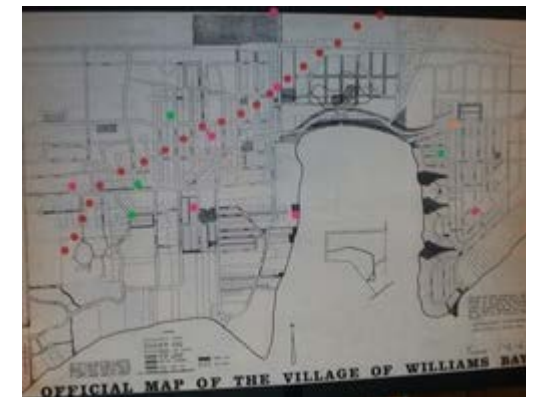
Map with addition of dots at locations where people attending program lived on April 11, 1965.