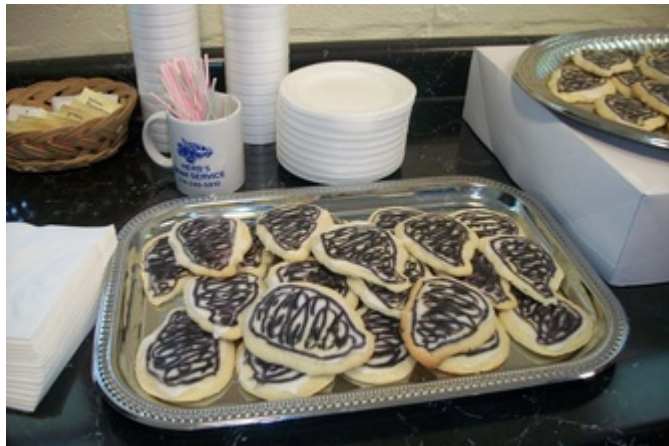
Delicious "Tornado" cookies

Newspapers with articles and photos of the damage caused by the F-1 tornado that swept through Williams Bay on Palm Sunday 1965.