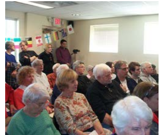
More than 60 people attended the program