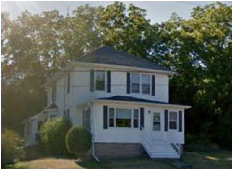
Southwick homestead.