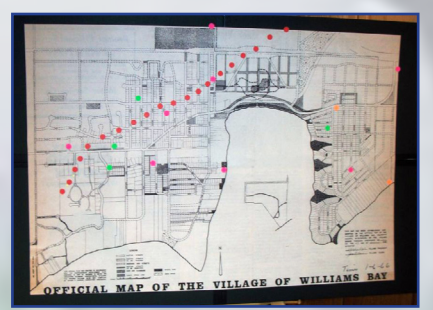
April 11, 1965 - April 11, 2015