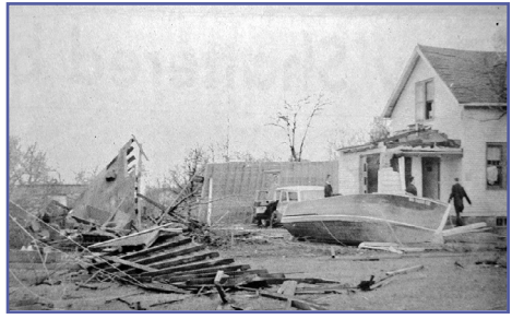
Joe Herman Home

Charles (Buzz) Wright observed the start of the storm in a low lying cloud at the southwest edge of the village. The cloud changed into the ominous funnel cloud that slammed into the village leaving a path of destruction. The tornado first destroyed a building on the College Camp golf course and then a garage at the home of Joe Herman as it moved into the village.