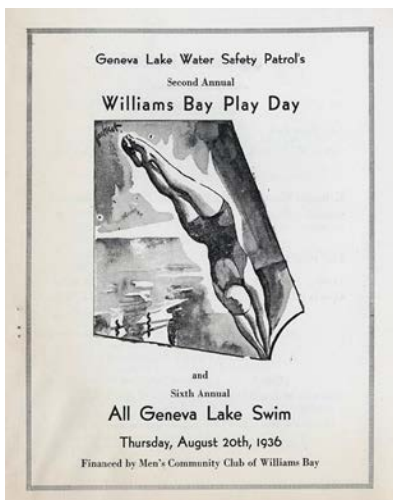
Play Day Flyer 1936

By 1925, the Water Safety Patrol began providing lifeguards at Geneva Lake beaches, and the organization purchased its first Patrol boat. The boat was used to expand the lifeguard services, and provide assistance and rescue to an increasing numbers of boaters on the lake. The Water Safety Patrol continued to grow to meet the ever increasing use of the lake.