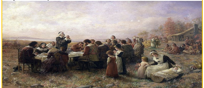
The First Thanksgiving at Plymouth by Jennie A. Brownscombe

Reprinted "Bay Leaves" November 24, 1937 Vol 5 No. 4