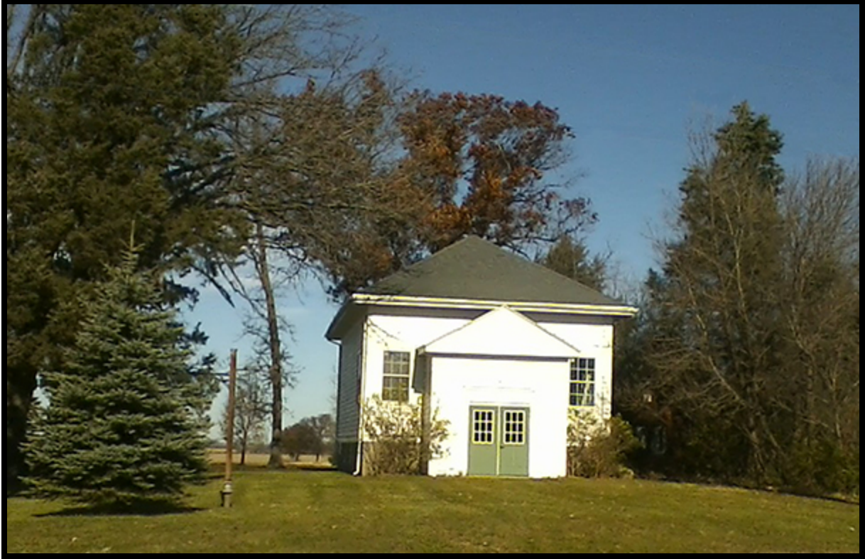
Bay Hill School today.

Bay Hill School Joint #10 closed sometime between the late 1940s and the 1950s. The district was incorporated with the Williams Bay and Fontana school districts.