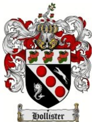
Hollister Family Crest