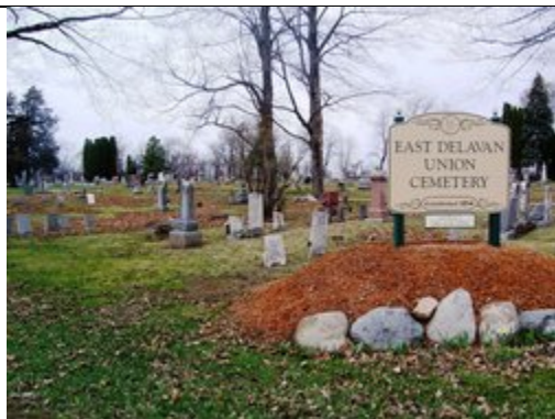
East Delavan Union Cemetery