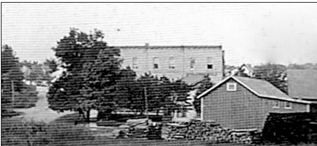
A. Hollister and Sons Lumber Yard circa 1915.