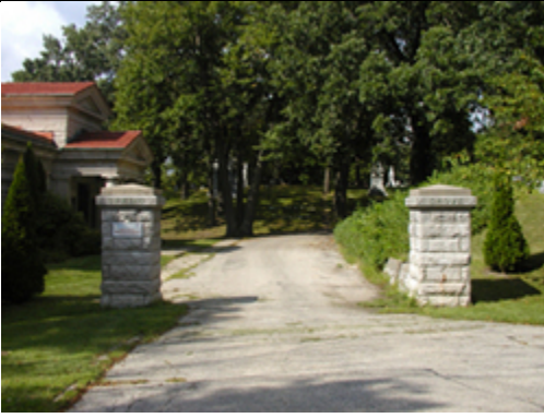
Spring Grove Cemetery, Delavan, W