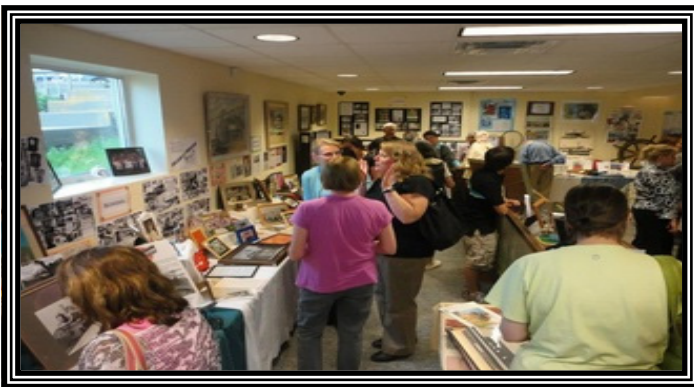
What a TERRIFIC turnout! THANK YOU WILLIAMS BAY!